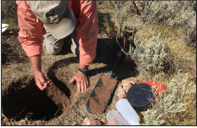
Dr. Chuck Butterfield of Y2 Consultants examines a soil pit.

When you think of Jackson Hole, you may picture the Tetons, a thick stand of golden aspen trees, or the mighty Snake River. But, this place wouldn't be what it is without rangelands—both wildlife and domestic livestock depend on these grasslands and shrublands for forage. Like many ecosystems, rangelands face natural and human-caused