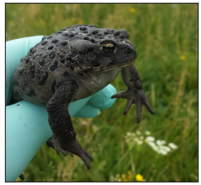
A western boreal toad sampled for chytrid fungus.

Commonly spotted species include boreal chorus frogs, Columbia spotted frogs, western boreal toads, and tiger salamanders. Globally, forty-one percent of all amphibian species are either extinct or threatened by extinction. Known threats to amphibians regionally include chytrid fungus, invasive predators, habitat loss and fragmentation, and chemicals and pollutants such as pesticides and herbicides. In past years, Morgan has swabbed frogs and toads for chytrid fungus, a disease that can kill our cold-blooded friends by inhibiting their ability to breathe through their skin. Of the 28 toads and frogs he swabbed in Teton County in 2017, 15 individuals tested positive for chytrid.