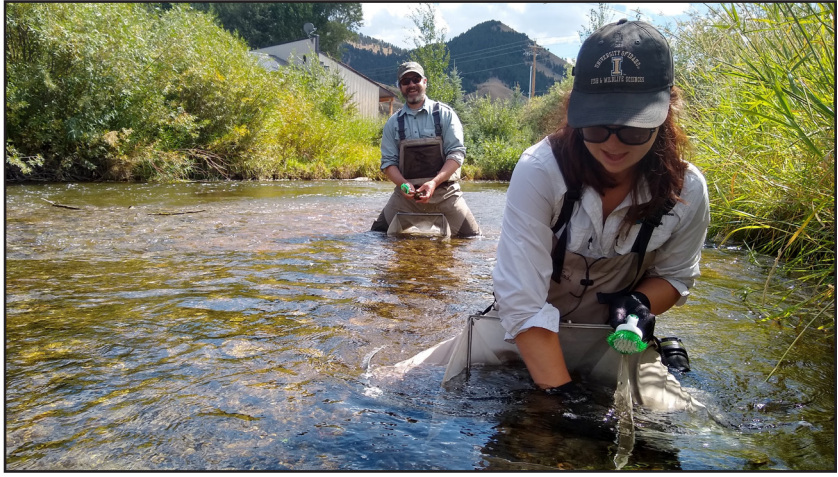
Macroinvertebrate sampling in Flat Creek.

new projects and lays the groundwork for the future of water quality and habitat restoration in Flat Creek and its tributaries.